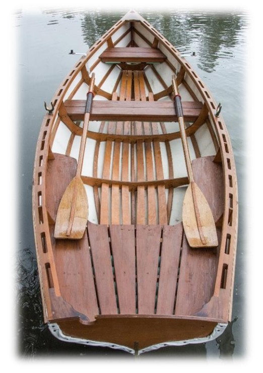
Celebrating Our Brethren Values Called to Serve

1392 Robert Fulton Highway Quarryville, PA 17566 Phone: 717.786.2723 www.mgcb.org